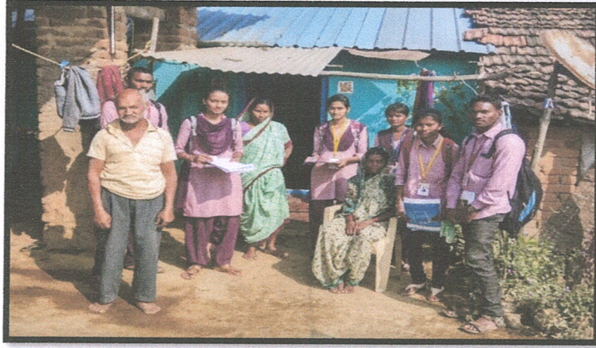
Students Collecting Data from villagers